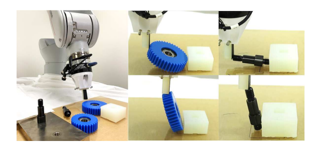
Fig. 1: We consider the problem of reorienting parts for assembly using pivoting manipulation primitive. Such reorientation could possibly be required when the parts being assembled are too big to grasp in the initial pose (such as the gears) or the parts to be inserted during assembly are not in the desired pose (such as the pegs). The figure shows some instances during the implementation of our controller to reorient a gear and a peg.

We briefly provide some physical intuition about frictional stability (see Fig. 2). First, suppose that uncertainty exists in mass of a body. In the case when the actual mass is lower than estimated, the friction force at point A would increase while the friction force at point B would decrease, compared to the nominal case. In contrast, suppose if the actual mass of the body is heavier than that of what we estimate, then the body can tumble along point B in the clockwise direction. In this case, we can imagine that the friction force at point A would