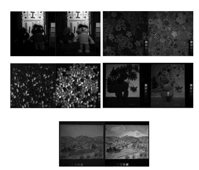
Fig. 5. CAVE dataset . Images from the multispectral CAVE dataset are arranged according to the following subsets from the top to the bottom row: chart and stuffed toy (CST), cloth (CL), jelly beans (JB), oil painting (OP), and water color (WC).

data comes with ground truth bundler [17] data that can be used to get the pixel location of 3D points seen by multiple cameras. We use this information to learn a model on points extracted from multiple image/pixel pair combinations across the dataset. In our experiments we specifically train a model on the Dubrovnik dataset. We use the model trained on this dataset to evaluate matching on the Oxford and AMOS dataset.