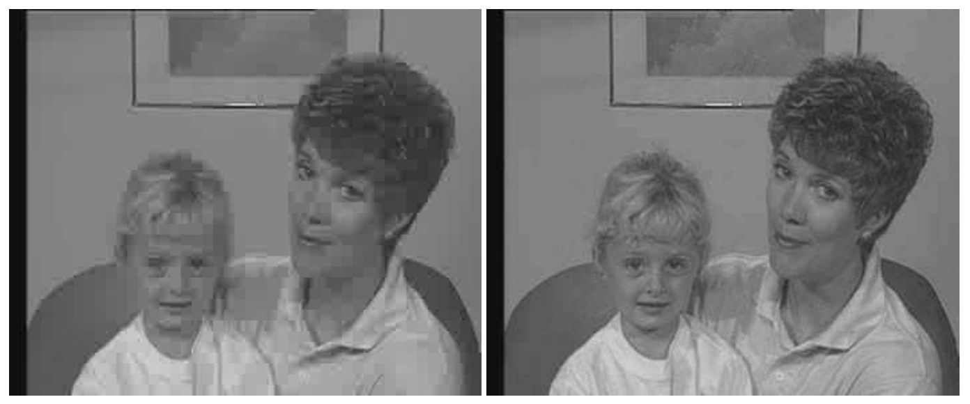
Fig. 3. Frame 14 of the CIF mother and daughter sequence at 1000 kb/second with H.263+Intra (left) and our distributed video codec (right).

close to inter-frame performance. We believe the appropriate conclusion is not that DVC systems are unworkable, but rather that intense research is needed to determine how the weakness of DVC systems can be improved and complemented by the strengths of traditional codecs.