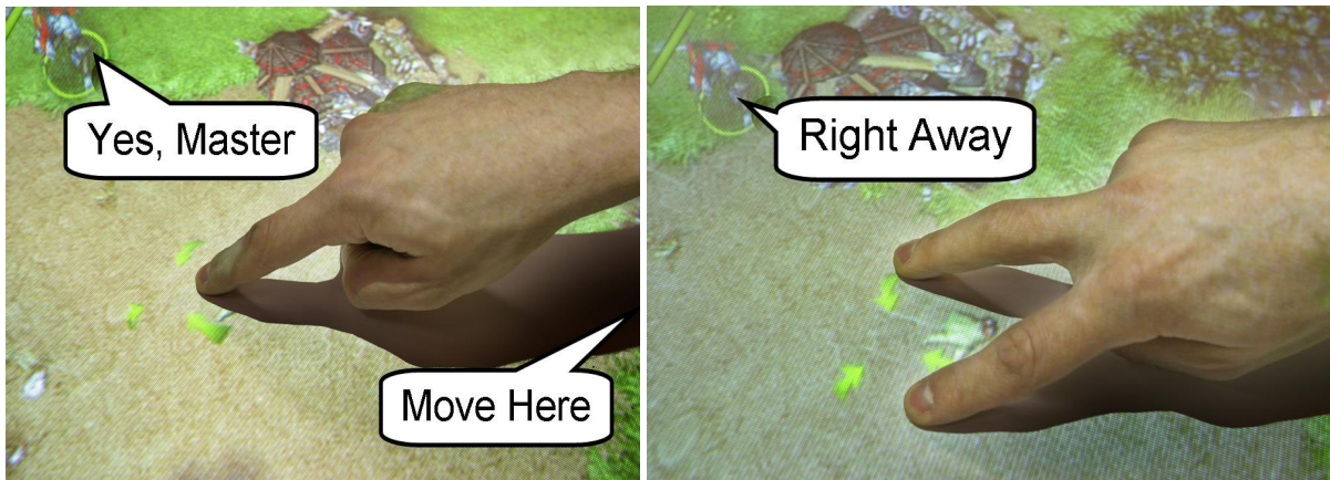
Figure 4. Warcraft III: 1-finger multimodal gesture (left), and 2-finger multimodal gesture (right)

then say ‘Build Barracks’ while pointing to the location where it should be built. This intermixing not only makes input simple and efficient, but makes the action sequence easier for others to understand.