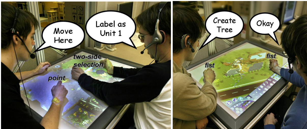
Figure 1. Two People Interacting with (left) Warcraft III, (right) The Sims

game system. Finally, we could explore the effects of multimodal input on different game genres simply by wrapping different commercial products. The two games we chose are described below.