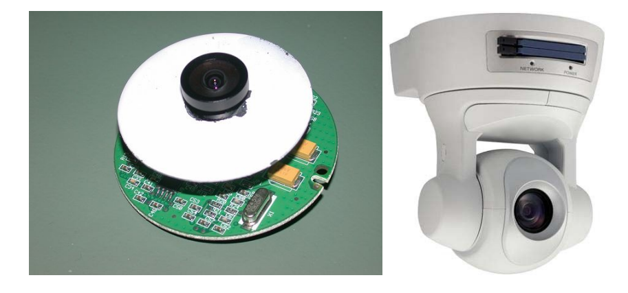
Figure 2: Left: camera designed for flush mounting on surface. Right: a pan-tilt-zoom camera system.

to invade the privacy of a building occupant in some way. the threat is even smaller, since the threat of inferring identity from pattern analysis is likely to be out of reach of an adversary with limited resources.