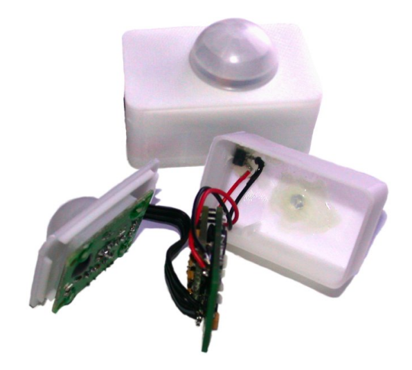
Figure 1: A wireless, passive, infrared motion detector. Note the non-optical lens.