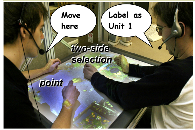
Figure 3. Two people interacting with Warcraft III. constraints raised by the application consider user input: interacting speech and gestures, mapping, and turntaking.