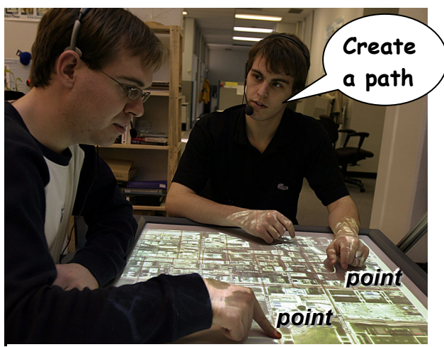
Figure 2. Google Earth on a table.

where the object to attack can be specified before, during or even after the speech utterance.