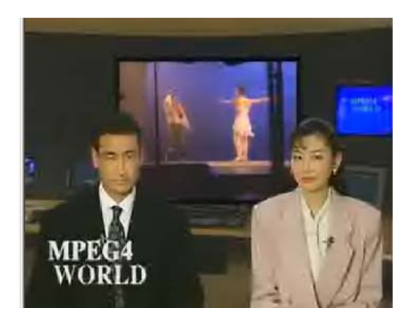
(e) Proposed method result; PSNR = 30.93 dB