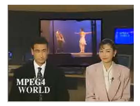
(c) MPEG-4 result; PSNR = 30.88 dB