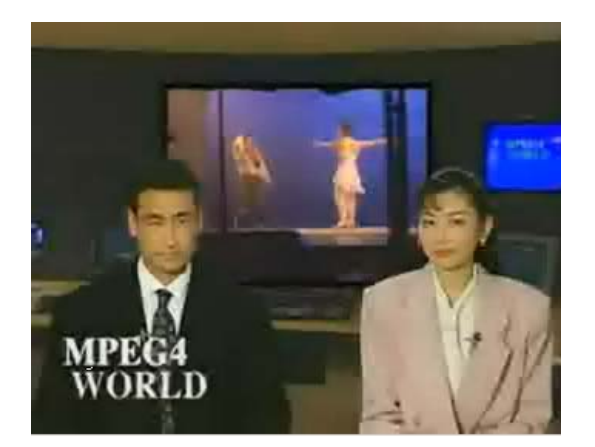
(b) Wavelet result; PSNR = 29.86 dB