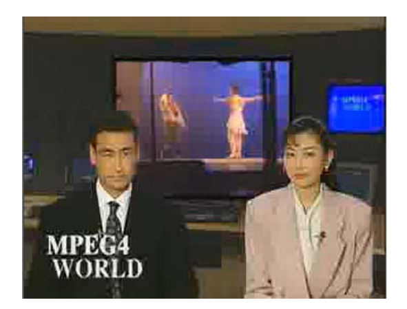
(a) Decoded image; PSNR = 30.69 dB