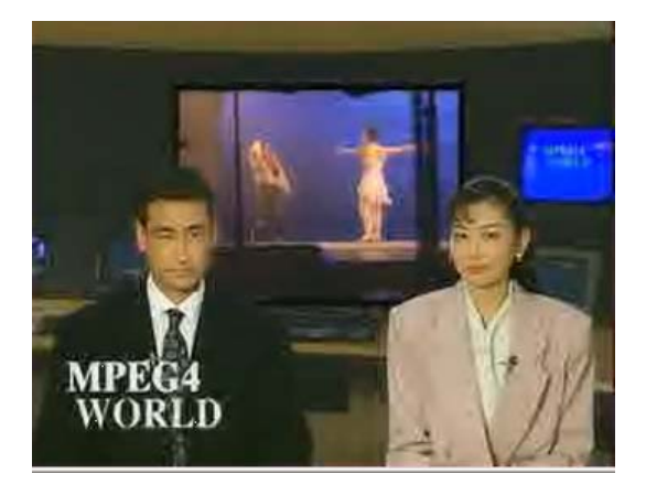
(d) POCS result; PSNR = 30.12 dB