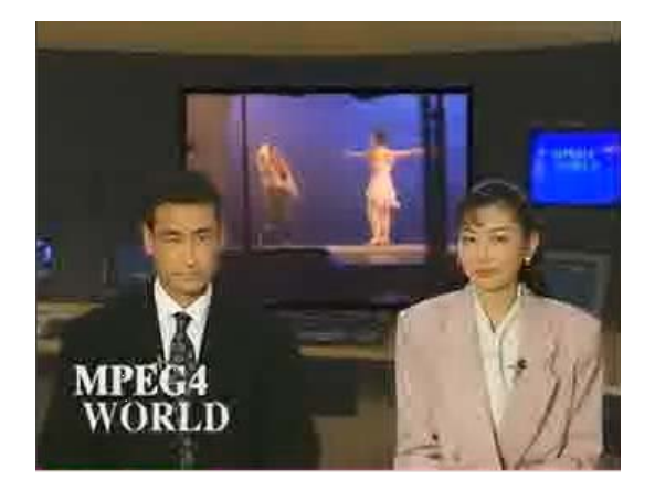
(e) DCT result; PSNR = 30.21 dB