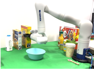
Figure 4: DMP-based Robot action for “Make a bowl of cereal”: top-down pick bowl, top-down place bowl, pick and pour cereal, and pick and pour milk.

where y' is sampled from the action sequence decoder D' and the semantic classifier S gives a probability that y' and c have the same semantic content. The binary cross entropy (BCE) loss is computed on the classifier output. To perform the back-propagation, we apply continuous approximation to the decoding process [16], where we sample y' from Gumbel softmax [17] to make y' differentiable. The classifier S is separately pre-trained with positive and negative caption samples c^+ and c^- to minimize the BCE loss