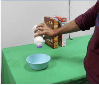
Figure 3: Epic-Kitchen-based action labels of human instruction for “Make a bowl of cereal”: place bowl, pour cereal, and pour milk.